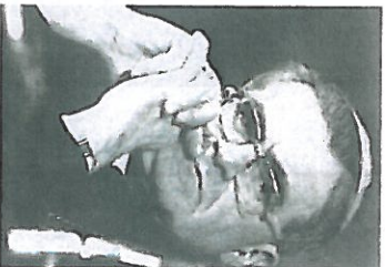
Julius Kardinal Döpfner (1913-1976)

Julius Kardinal Döpfner was one of the moderators of the Second Vatican Council and influenced the clerical renewal in Germany. His openness, his courage, and his readiness to communicate with representatives of all social classes mark work and life in this educational centre. Guests of all religions and social groups are welcome here.